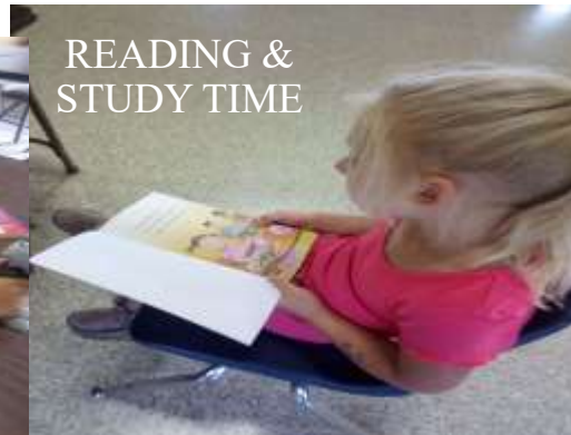
READING & STUDY TIME