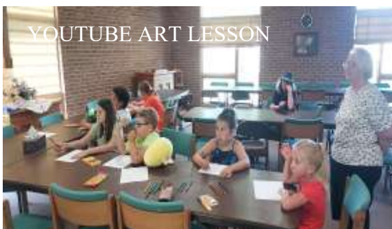
YOUTUBE ART LESSON