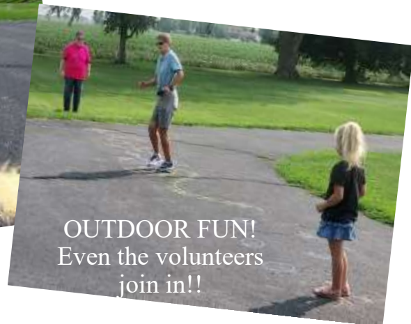
OUTDOOR FUN! Even the volunteers join in!!